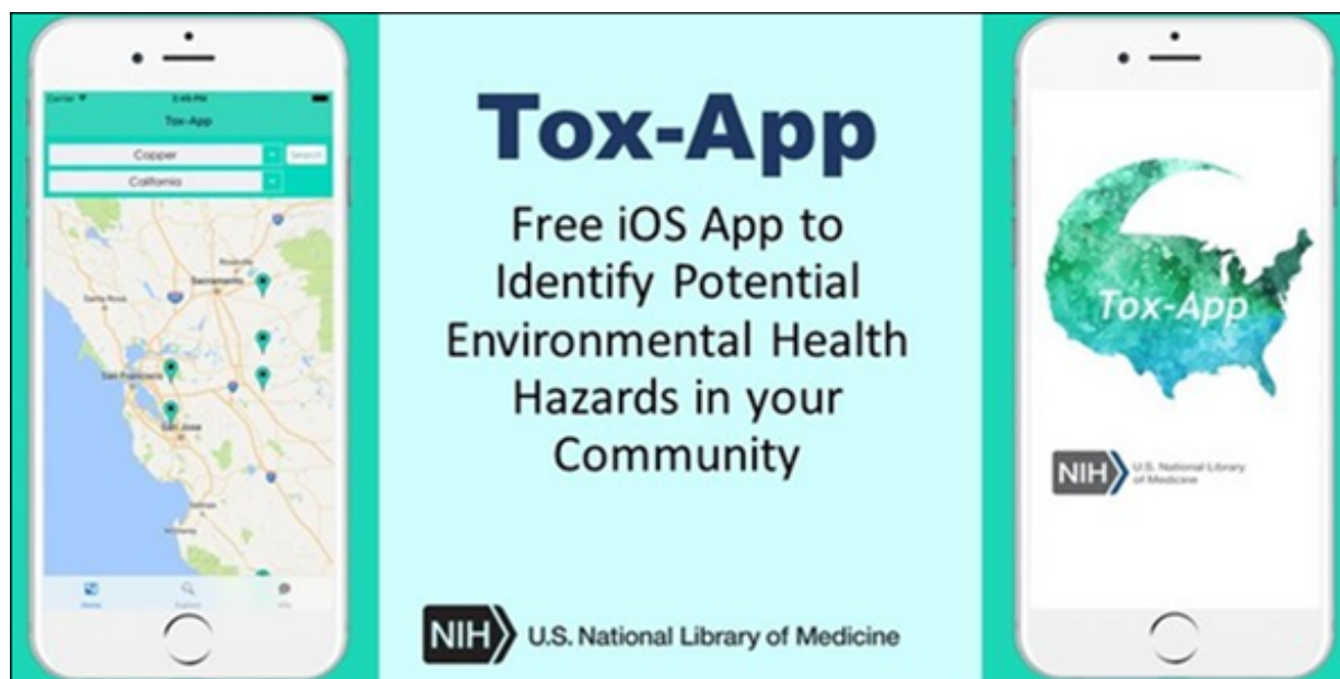
Figure 1: Tox-App mobile app for iOS.

Learn more about Tox-App here: https://go.usa.gov/xRhby