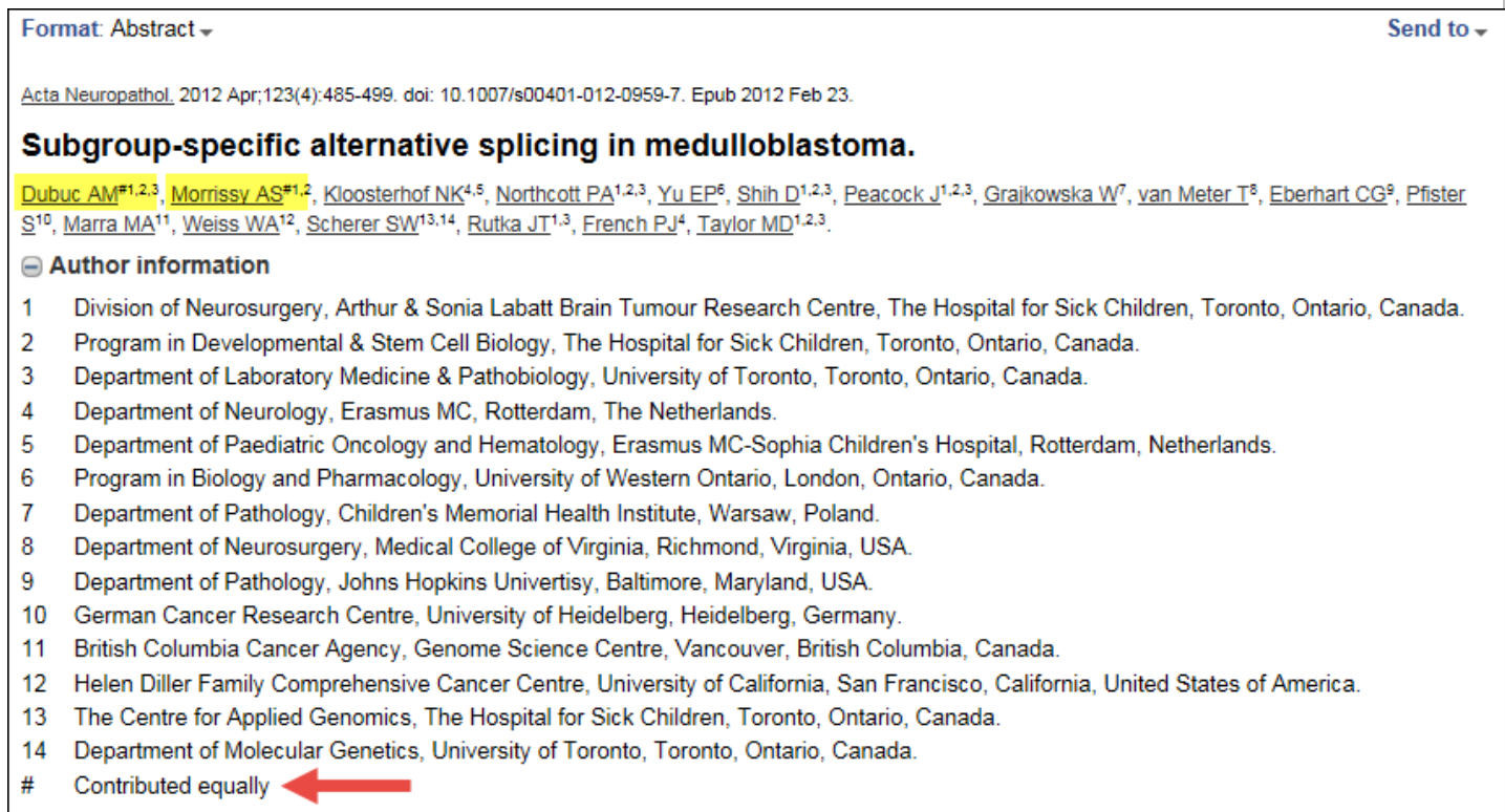
Figure 1: Equally contributing authors in author section of PubMed abstract display.

1. Abstract display format: in the author section (see Figure 1).