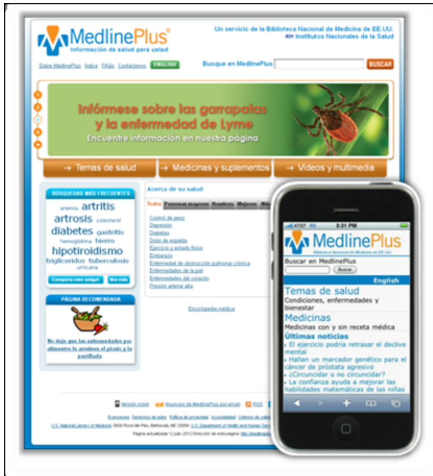
Figure 1: MedlinePlus en español Web and mobile versions.

To learn more about how MedlinePlus en español has evolved over the last ten years, visit our information page in English and Spanish.