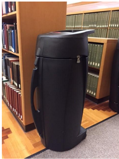
Shipping Container 48" H x 19" W x 19" D

Each exhibition travels in two wheeled containers with banners and hardware packed in cloth bags. See below for outside and inside images of a shipping container.