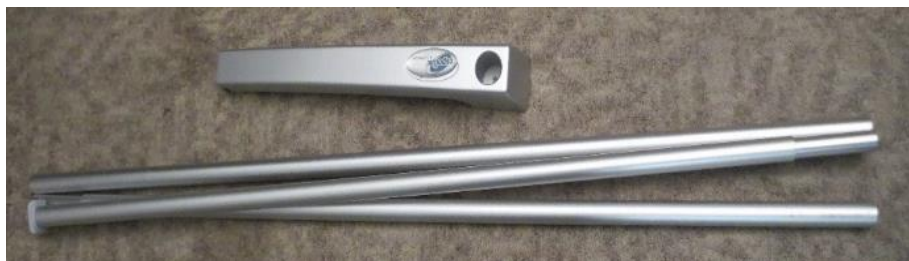
A hardware set of a collapsible pole and a metal base