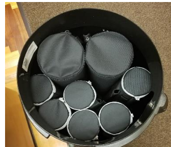
Each container holds 6 banners and 6 hardware sets.

In addition, a shipping container holds: